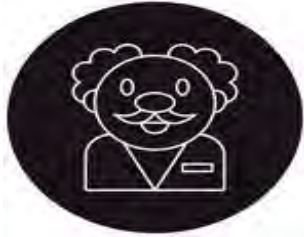
The Research Community